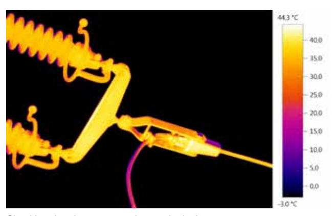
Checking the clamp connection on the isolator