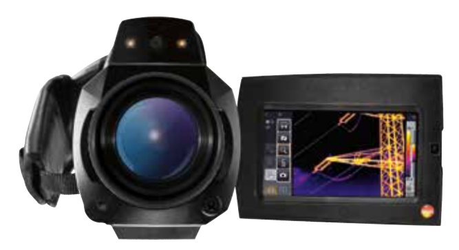
Thermal imager testo 890

A further challenge lies in the cooling oil of the transformers. Due to eroded insulation, slurry can occur here, which is deposited in the cooling ribs. The blockage of the throughflow in the affected cooling ribs initially compromises the cooling, and in the worst case can result in the failure of the complete cooling function of the transformer.